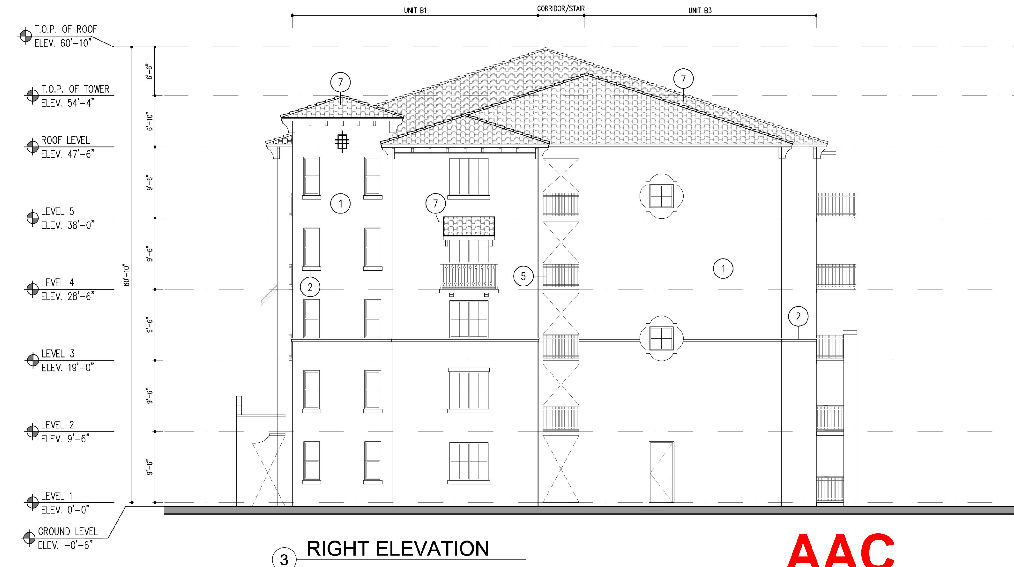
3 RIGHT ELEVATION